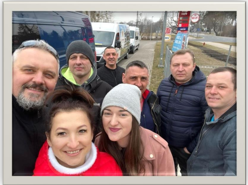
Transports on the Way to Ukraine

we took her to our church's help center to be able to talk and connect with Ukrainian people and our church members. She then traveled to the southern city of Katowice where her niece lives. She was hoping to find a job doing in-home elder care. Eventually the wave of refugee migration slowed down giving the help centers breathing room to rotate their workers and refine their ministries to their needs. Because of generous donations we have been able to directly provide personal needs to Ukrainians since they could only carry so much when they escaped from their hometowns. We also have supported the local church help centers with various costs including added utilities for their buildings. Some of their utility bills will also be higher because of the rise in energy prices. A pastor friend from Białystok recently posted a need for paying for fuel and drivers to get aid (food, medicine, other items) into Ukraine. We have been able to support two of the weekly trips and hope to continue to do so. We included prayer requests below and we look ahead to the need for God's help as this crisis continues and will hopefully soon change into recovery and restoration.