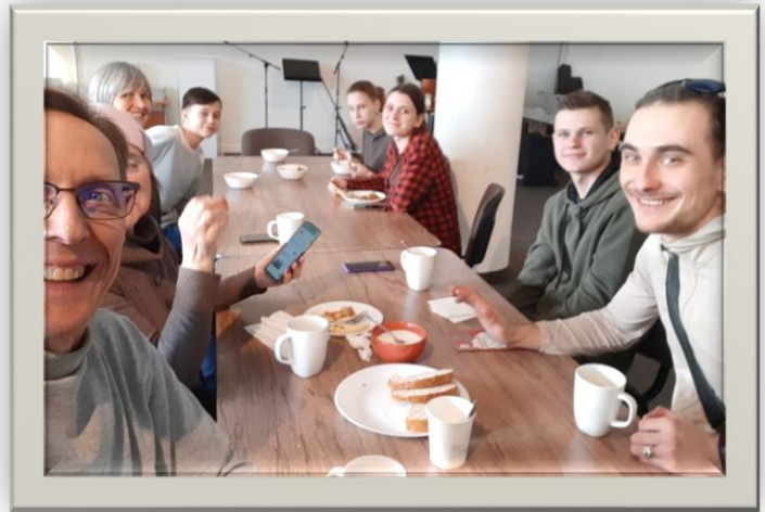
Food and Fellowship at the Help Center