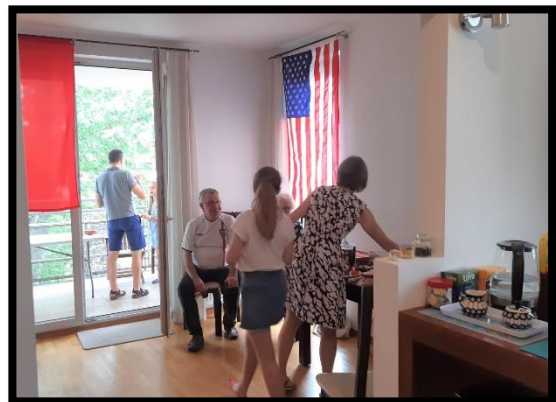
Open House at Our New Apartment