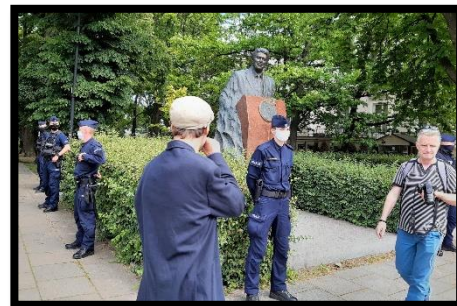
Police Guard Reagan Statue

GOSPEL GROUP - Our Gospel Group started the year with the goal of finishing the Story of Hope booklet ("Historia Nadziei") by the end of the year. Covid-19 forced us online, but it also enabled us to add more people. For a time we were doing two meetings a week! But as we've approached the end, things have gotten more difficult. As the restrictions were lifted and summer began, people became more active (thank the Lord!) but also more unavailable. So it has been hard to meet to finish up the Bridge to Life, eight-word summary of the forty stories from the Bible. This summary brings together all the teaching about how God's rescue plan can give a person full forgiveness, reconciliation to God and the hope of heaven. Some in the group are struggling as they face the dilemma of changing what they always have believed. This is a spiritual battle and for some Polish people, this can go on for quite a while. Our group has planned a back-yard picnic to conclude our study. Members will meet individually with each other until we are able to plan a new group with a new direction.