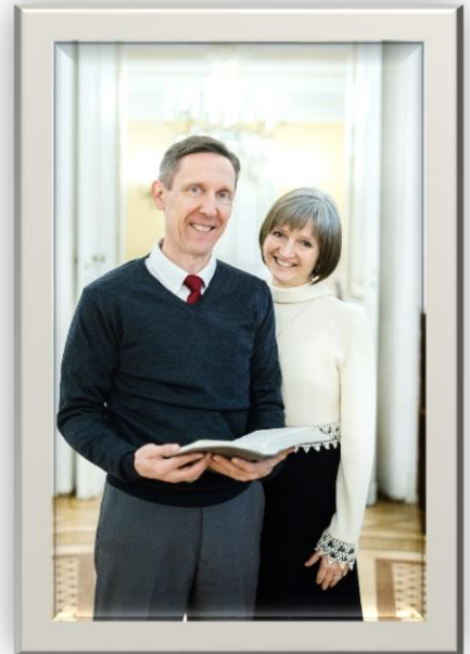
“Points of Light”