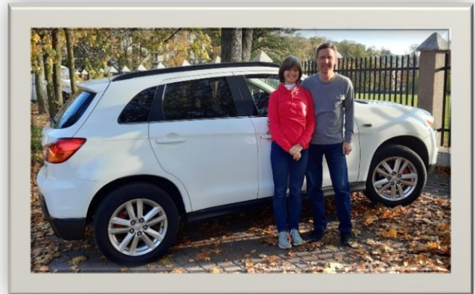
2011 Mitsubishi ASX

The "Karta Pojazdu" booklet is essentially the car title. Each time a car is bought and sold in Poland, the booklet is also transferred to the new owner, with the new owner's information recorded in the booklet. Since this is the first time our car has been registered in Poland, our book is brand new. This vehicle will allow us to travel to more point-to-point ministry opportunities and increase our overall effectiveness in time use. We thank the Lord for all the partners who contributed to our car fund.