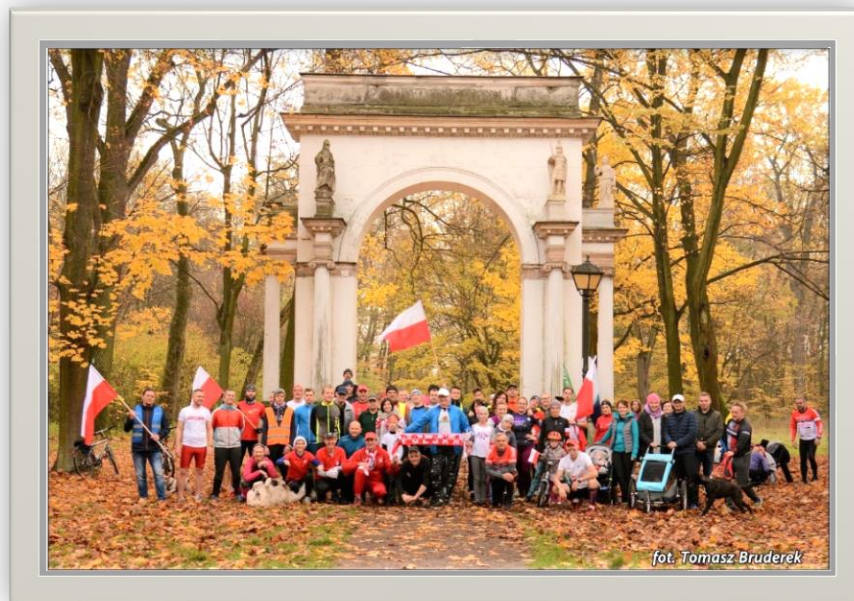
Patriotic Park Run in Jabłonna