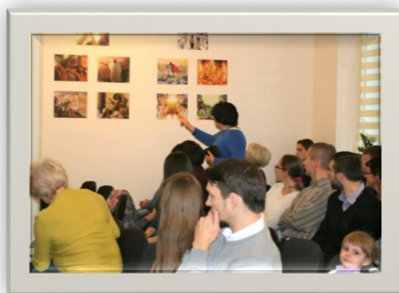
Church Member Explains Stories from "Historia Nadziei"