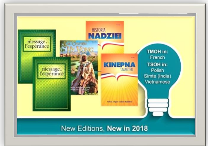
"Historia Nadziei" will Soon be Available at Good Soil Evangelism

We appreciate the extra gifts that were given last month. They really helped with larger than normal expenses due to replenishing our stock of Bibles, Gospel literature, evangelistic tools and airfare for our furlough. We will still need to expand our partnership base to meet our general needs along with the car fund and future translation projects.