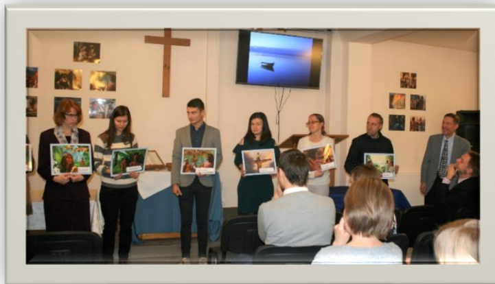
Great review of "Story of Hope"

With the purchase of this last set of Bibles, our literature fund has been depleted. We will need additional funds to resupply the next set of Bibles after this one is sold out. If you would like to contribute to this project, simply designate your gift, "Literature Fund." We are very excited that we, as a team, can provide a steady supply of good Bibles to the Polish speaking people who need and read them in the US.