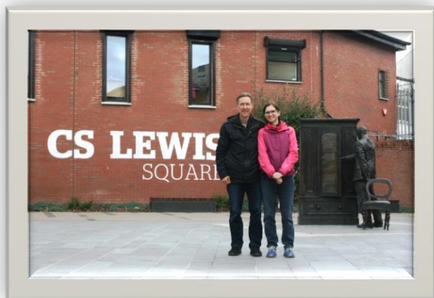
CS Lewis Square in Belfast