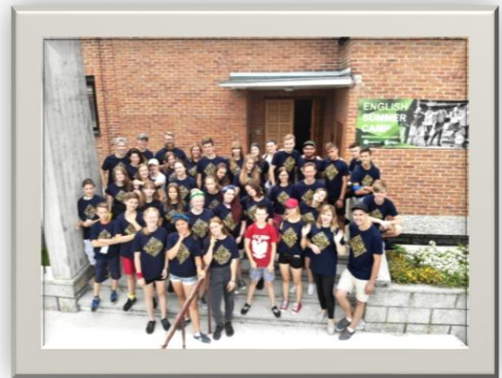
English Camp at Chełm Baptist Church