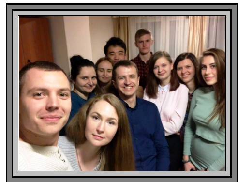
Young People at Lublin Baptist