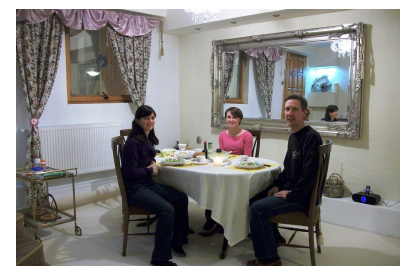
Our New Dining Room

train with our luggage and stood almost entirely for the 2.5 hour ride to Lublin. Needless to