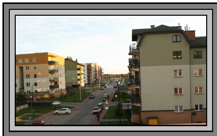
Fulmana Apartment Buildings

We've been amazed at the doors God has opened for us in Poland. One example is that of our neighbor who lives directly above us in our apartment building. Our church has an outreach program for special needs children once a month on a Saturday. Our neighbor above us has a child with down syndrome. One day, we invited the mom and child -- they came the following Saturday, loved it, and plan to continue to come. It was a simple but glorious advance of God's grace into their lives.