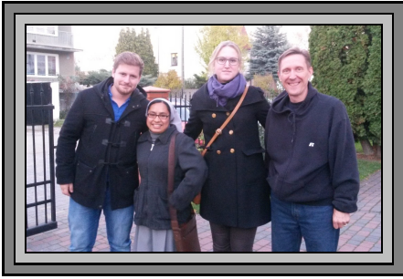
Language School Friends